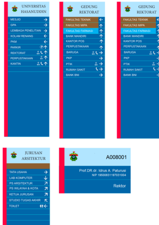
Figure 4. Color Schematic in Wayfinding System.

tried to be an accent color in the Lecture Theater Building on the grounds that users would know quickly the location of the main entrance of the building. The trend quickly used red on all the building doors, so that the red color was no longer as an accent but became a common color in the building.