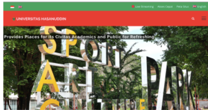
Figure 6. Unhas' website in 2020.