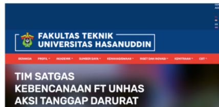
Figure 7. Faculty of Engineering's website in 2021.